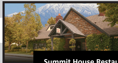
Summit House Restaurant 2000 E. Bastanchury Road, Fullerton

This Legacy Forum is part of an ongoing information series for parents, alumni and other friends of Servite.